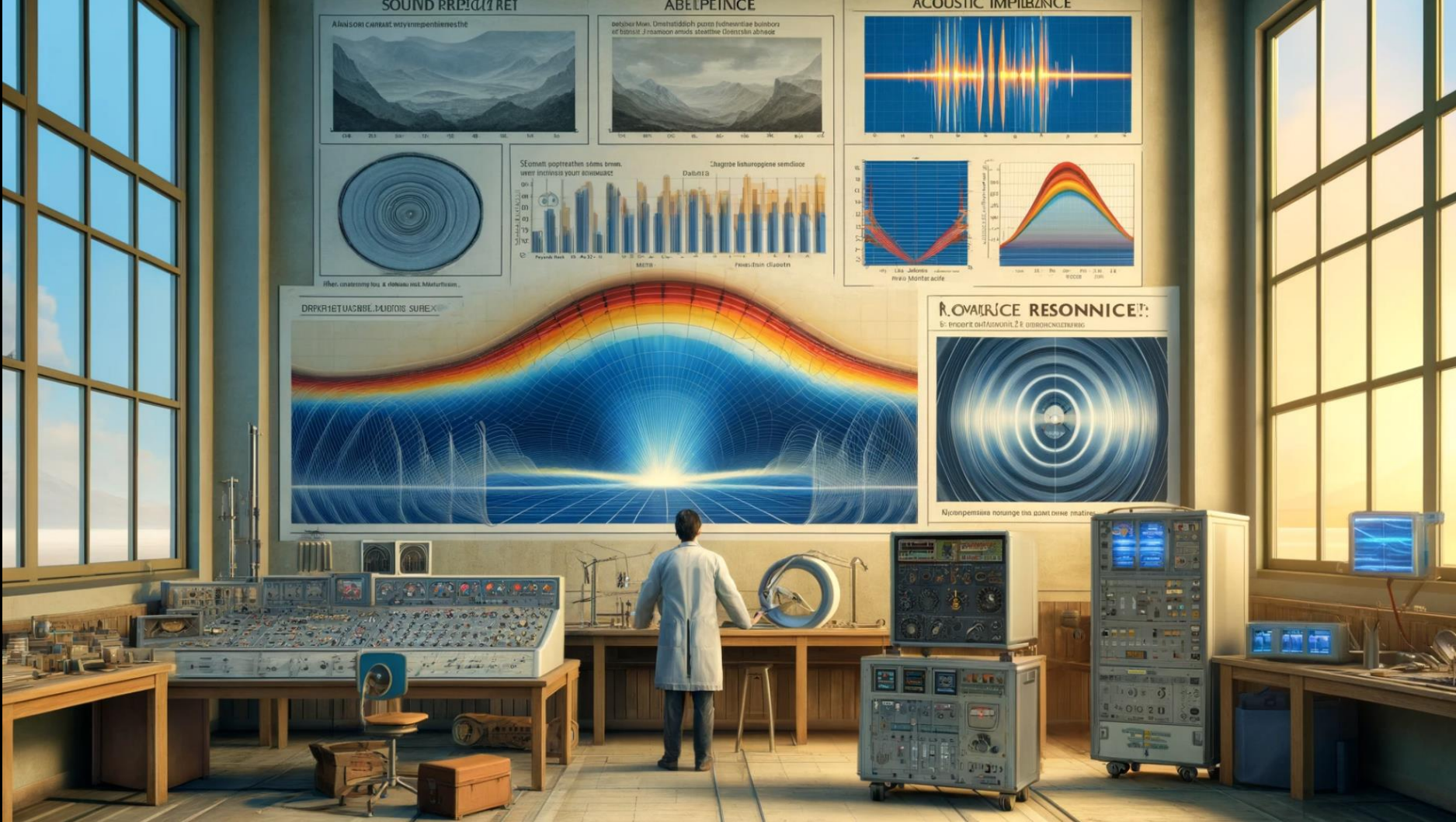
ChatGPT4/DALL-E Rendition of Physical Acoustics, 5/6/2024